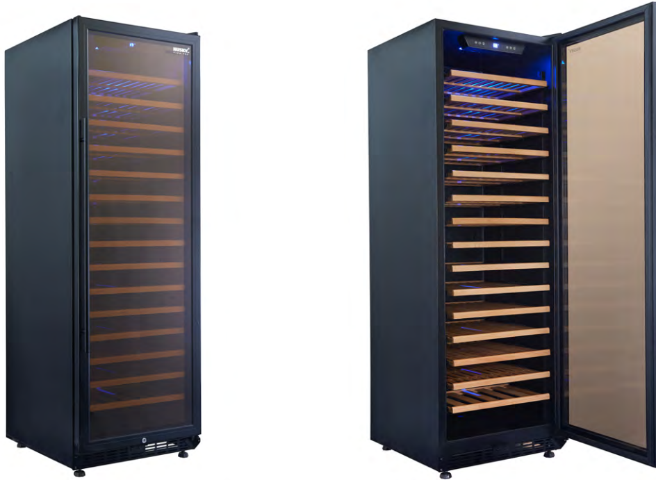
Black Trim Shown